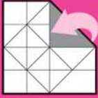
Step 1: Fold each outside corner toward the center.

Before you start folding, make sure the blank side of the paper is facing up towards you.